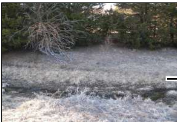
Photo Point 1 - Jan. 23, 2008 West