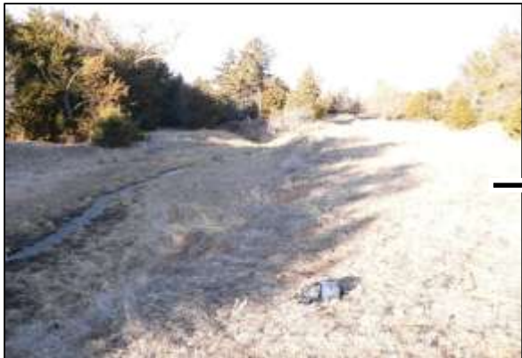
Photo Point 1 - Jan. 23, 2008 North