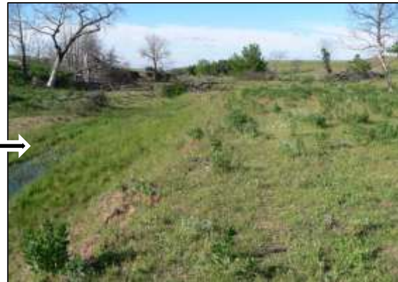
Photo Point 1 - May 27, 2009 North