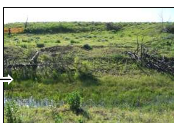
Photo Point 1 - May 27, 2009 West