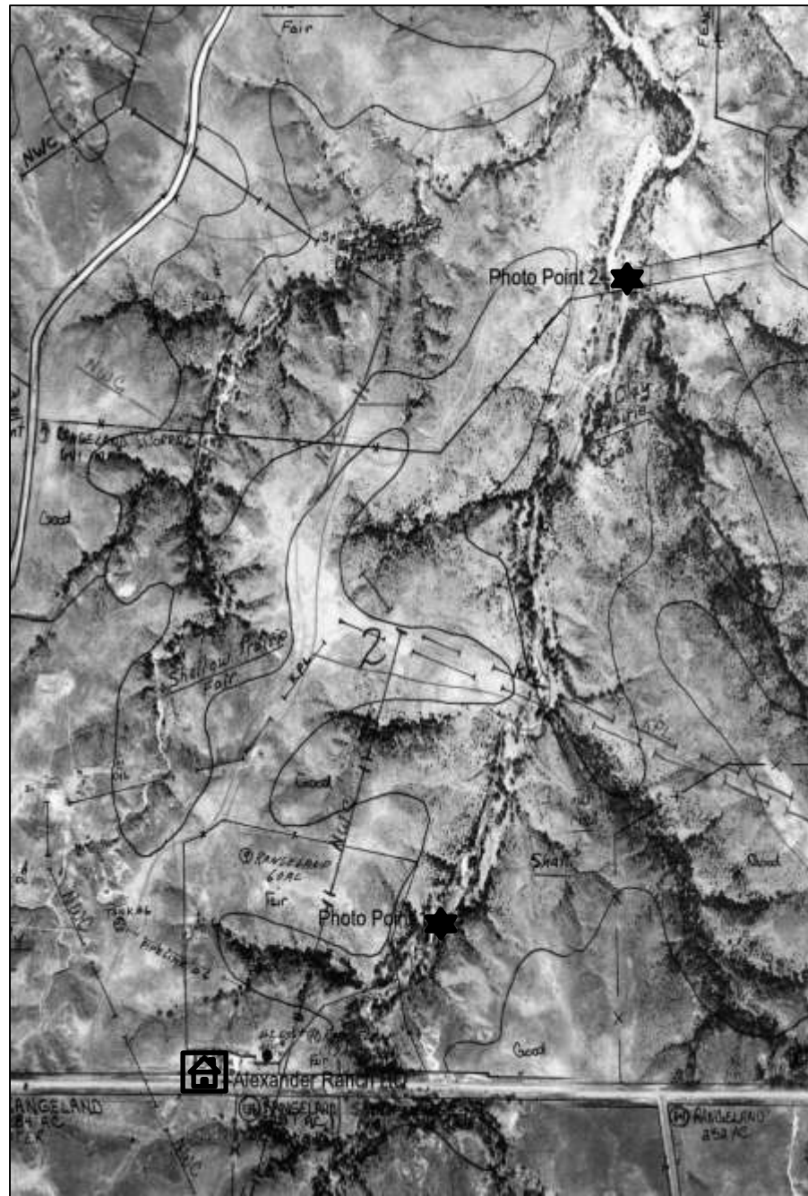
Steward Creek - 1979