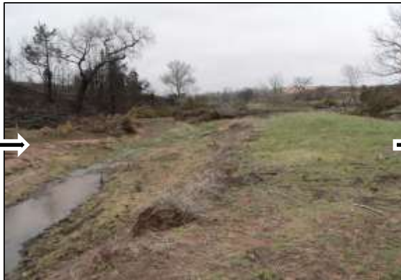
Photo Point 1 - April 24, 2008 North